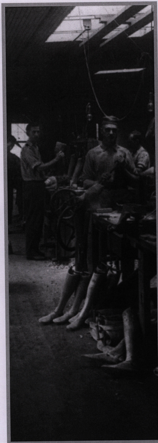
Photo at right: Men at work [making artificial legs] in the J.E. Hangar shop, a manufacturer of artificial limbs in Washington, D.C.

Poet Lore 4508 Walsh Street Bethesda, MD 20815